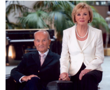
Reinhard and Liz Mohn